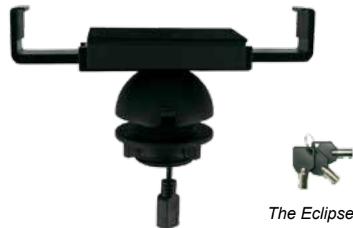
The Eclipse 2 includes locking keys